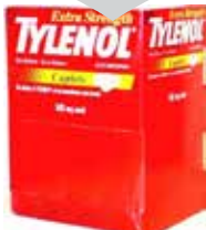
TYLENOL CAPLETS 500 gr 2 pk - 50 pch X 36