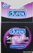
DUREX CONDOMS SENSI-THIN 3pk