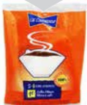
GK CONNAISSEUR - COFFEE FILTERS - #4 CONE - 40PK