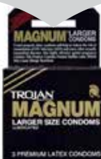
TROJAN CONDOM 3S BLACK MAGNUM