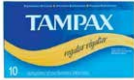
TAMPAX TAMPON REGULAR UNSCENTED