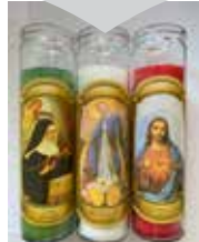
GLASS CANDLE WITH PICTURE 12 IN BOX