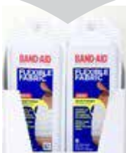
JOHNSON & JOHNSON BAND AID FABRIC 8 PK X 12