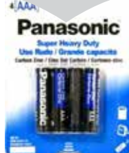
PANASONIC BATTERY AAA4 HD