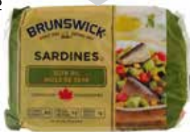
BRUNSWICK SARDINES SOYA OIL 106g X 18