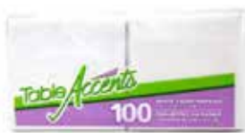
TABLE ACCENTS - NAPKINS 12" X 11.9" 1-PLY WHITE-100PK

PRICES SUBJECT TO CHANGE WITHOUT NOTICE APPLICABLE TAXES APPLY P.31