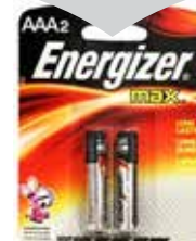
ENERGIZER BATTERY AAA2