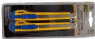
2 UTILITY KNIVES CK-2