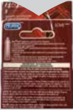
DUREX CONDOM 3S LOVE