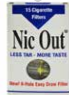
NIC OUT CIGARETTE FILTERS (15 pcs) 24 in box