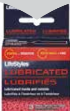
LIFESTYLE CONDOM 3S LUBRICATED