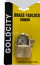
BRASS PADLOCK 30MM