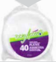
TABLE ACCENTS - FOAM PLATES - 9" - THICK - 40PK