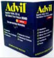
ADVIL DISPENSER 50 X 2'S