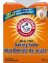
ARM & HAMMER BAKING SODA 500gr 12