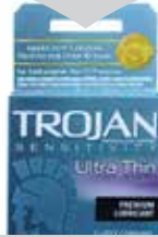
TROJAN CONDOM 3S ULTRA THIN