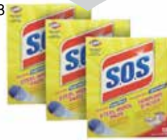
SOS PADS REGULAR 10 pcs