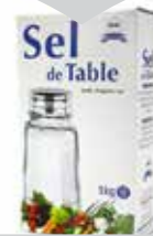
SUNBEC TABLE SALT 1 KG