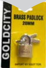
BRASS PADLOCK 20MM