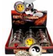
TOBACCO METAL GRINDER SMALL – ASSORTED