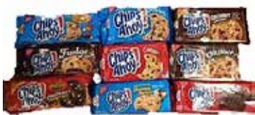
CHIPS AHOY COOKIES ALL FLAVOURS