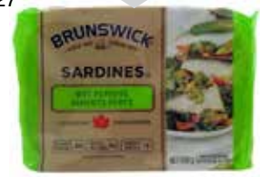
BRUNSWICK SARDINES WITH HOT PEPPERS 106g X 18