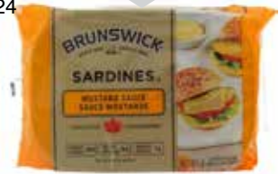
BRUNSWICK SARDINES MUSTARD SAUCE EO 106g X 18

PRICES SUBJECT TO CHANGE WITHOUT NOTICE APPLICABLE TAXES APPLY P.12