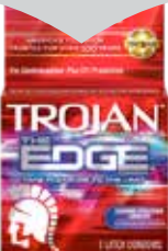
TROJAN CONDOM 3S EDGE