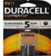
DURACELL BATTERY 9V1 (COPPERTOP)