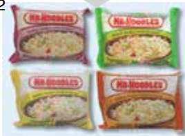
MR.NOODLES 24 PK ALL FLAVOURS