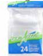
TABLE ACCENTS - PLASTIC TEA SPOONS - CLEAR - 24PK