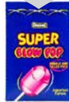
SUPER BLOW POP 36 IN BOX