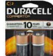
DURACELL BATTERY C2 (COPPERTOP)