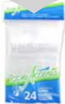
TABLE ACCENTS - PLASTIC FORKS - CLEAR - 24PK