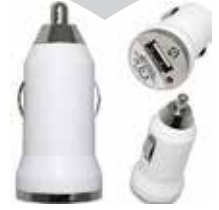
CAR SINGLE CHARGER