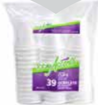
TABLE ACCENTS - FOAM CUPS 185 ML (6.5 OZ) - 39 PK