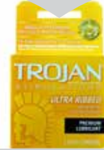
TROJAN CONDOM 3S ULTRA RIBBED