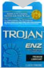
TROJAN CONDOM 3S LUBRICATED BLUE