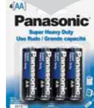
PANASONIC BATTERY AA4 HD