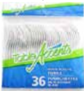
TABLE ACCENTS - PLASTIC FORKS - WHITE - 36PK