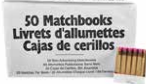
EDDY MATCHES BK 50S