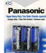
PANASONIC BATTERY C2 HD