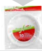
TABLE ACCENTS - PLASTIC PLATES 9" - 10PK