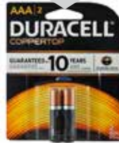
DURACELL BATTERY AAA2 (COPPERTOP)