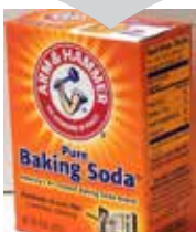
ARM & HAMMER BAKING SODA 227gr 24