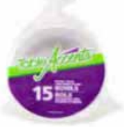
TABLE ACCENTS FOAM BOWLS 12 OZ THICK - 15PK