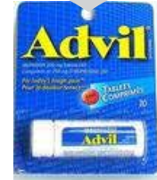
ADVIL TUBE DISPLAY 10pk TAB X 12