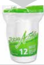
TABLE ACCENTS - PLASTIC BEER CUPS 16 OZ WHITE - 12PK