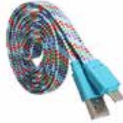
TYPE C FLAT USB