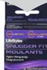
LIFESTYLE CONDOM 3S SNUGGER FIT MOULANTS