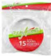
TABLE ACCENTS PLASTIC PLATES 6" - 15PK