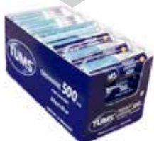
TUMS REGULAR STRENGTH 18 ROLLS