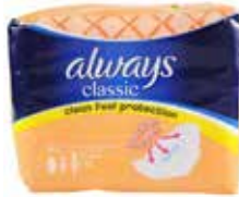
ALWAYS CLASSIC WINGS 10S