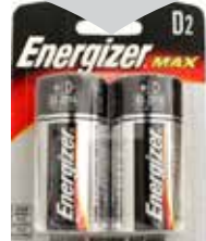
ENERGIZER BATTERY D2