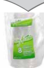
TABLE ACCENTS - PLASTIC GLASSES - 16 OZ - CLEAR - 8PK

PRICES SUBJECT TO CHANGE WITHOUT NOTICE APPLICABLE TAXES APPLY P.30