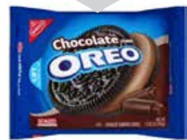
OREO COOKIES DOUBLE CHOCOLATE