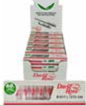
DAVID ROSS MINI FILTERS (10 pcs) 36S