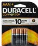
DURACELL BATTERY AAA4 (COPPERTOP)