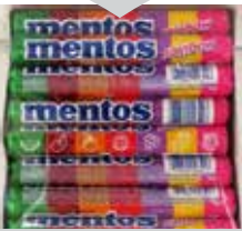
MENTOS SINGLES 37g RAINBOW X 20 PK