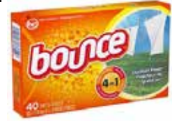
BOUNCE 40 SHEETS

PRICES SUBJECT TO CHANGE WITHOUT NOTICE APPLICABLE TAXES APPLY P.22