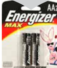
ENERGIZER BATTERY AA2