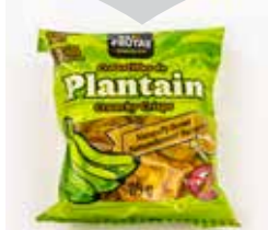
PLANTAIN CHIPYS SWEET 85G 50 IN BOX