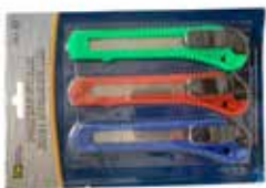
3 PACK KNIVES WITH BLADE CK-3