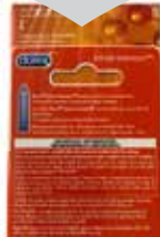
DUREX CONDOM 3S INTENSE SENSATION