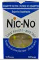
NIC NO CIGARETTE FILTERS (15 pcs) 36 in box