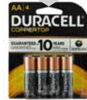
DURACELL BATTERY AA4 (COPPERTOP)