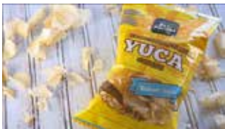
Yuca Salted 85 g ( 12 in Box)