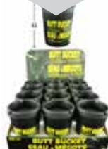
EXTINGUISHING ASHTRAY BUTT BUCKET SMALL