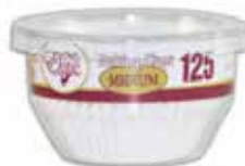
CHEF ELITE - BAKING CUPS MEDIUM WHITE - 125PK

PRICES SUBJECT TO CHANGE WITHOUT NOTICE APPLICABLE TAXES APPLY P.32