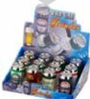
TOBACCO METAL GRINDER 3 PARTS 32MM