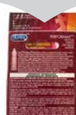
DUREX CONDOM 3S PERFORMAX

PRICES SUBJECT TO CHANGE WITHOUT NOTICE APPLICABLE TAXES APPLY P.8