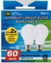
LIGHT BULB 24X2 PACK 60 WATT