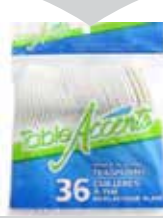
TABLE ACCENTS - PLASTIC TEA SPOONS - WHITE - 36PK