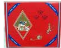
THREE KING CHARCOAL (KING SIZE) 10-Briquets-10 Rolls