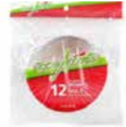
TABLE ACCENTS PLASTIC BOWLS 12 OZ - 12PK