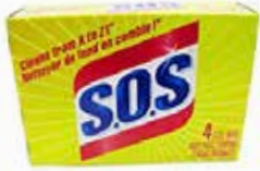
S.O.S - 4 IN PACK