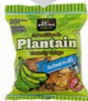
PLANTAIN CHIPY SALTED 85G 50 IN BOX