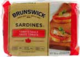
BRUNSWICK SARDINES TOMATO SAUCE 106g X 18