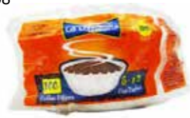
GK CONNAISSEUR - COFFEE FILTERS (8/12 CUP) BASKET - 100PK