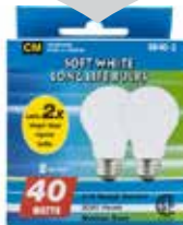
LIGHT BULB 24X2 PACK 40 WATT