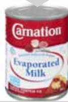
CARNATION EVAPORATED MILK 354ML