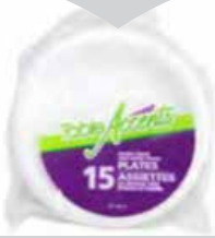
TABLE ACCENTS - FOAM PLATES - 9" - THICK - 15PK