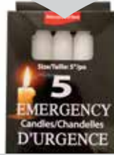
EMERGENCY CANDLE 5 PK