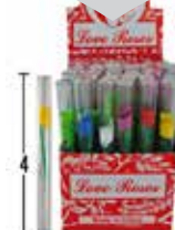
ROSE PEN PIPES (36 PCS/DISPLAY)