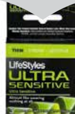
LIFESTYLE CONDOM 3S ULTRA SENSITIVE