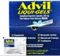
ADVIL POUCH LIQUID GEL 50 x 2 S