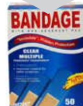
INSTANT AID CLEAR BANDAGE ASST 50 PK

PRICES SUBJECT TO CHANGE WITHOUT NOTICE APPLICABLE TAXES APPLY P.16