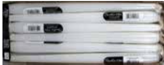
12 INCH TAPER CANDLE WHITE (0212595) X 12