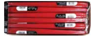
12 INCH TAPER CANDLE RED x 12