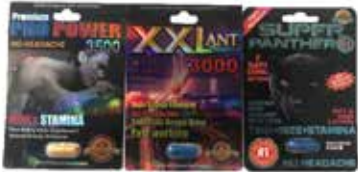
MALE ENERGY ENHANCER 1 CAPSULE