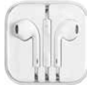
EAR PHONE MIX COLOUR 12 PCS