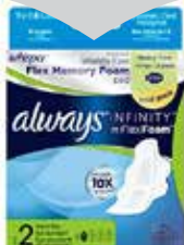
ALWAYS INFINITY FLEX FOAM 3 PADS SIZE 2