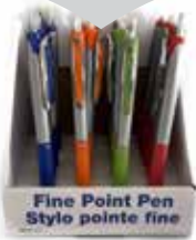
FINE POINT PEN 24 PCS