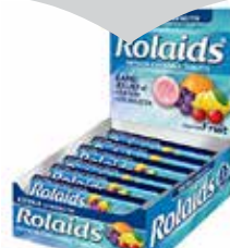
ROLAIDS ASSORTED FRUIT 12 ROLLS

PRICES SUBJECT TO CHANGE WITHOUT NOTICE APPLICABLE TAXES APPLY P.1