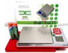
SCALE (INFYNITY) 50 G X 0.01G

PRICES SUBJECT TO CHANGE WITHOUT NOTICE APPLICABLE TAXES APPLY P.27