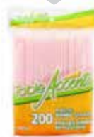
TABLE ACCENTS - JUMBO STRAWS - 8" - 200PK