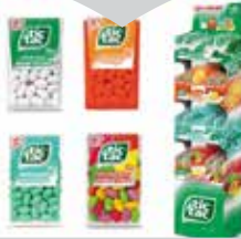
Tic Tac 5 Flavour 29g (72 in Box)