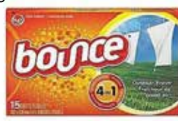
BOUNCE 15 PK