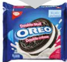
OREO COOKIES DOUBLE STUFF