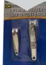
2 PC NAIL CLIPPER NL-2