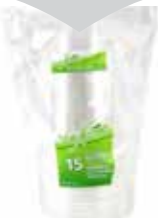
TABLE ACCENTS - PLASTIC GLASSES 10 OZ CLEAR - 15PK