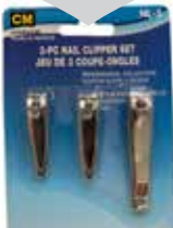
PC NAIL CLIPPER SET NL-3