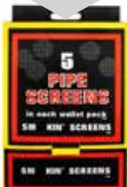
PIPE SCREENS SILVER (100s)