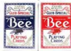
PLAYING CARDS DEALERS DOZEN (BEE)