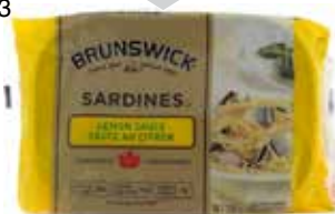
BRUNSWICK SARDINES LEMON SAUCE 106g X 18