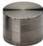
TOBACCO METAL GRINDER 4 PARTS 50MM