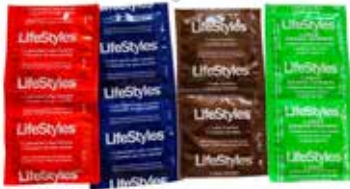
LIFE STYLE CONDOM 144 in box