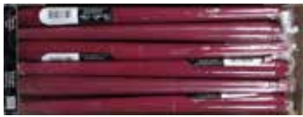
12 INCH TAPER CANDLE BURGUNDY X 12