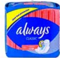
ALWAYS CLASSICS 10S