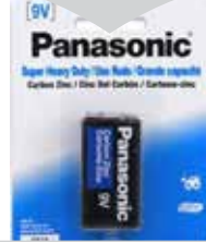
PANASONIC BATTERY 9V1 HD