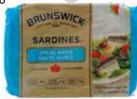
BRUNSWICK SARDINES WATER EO 106g X 18