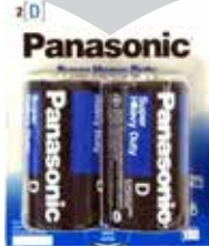
PANASONIC BATTERY D2 HD