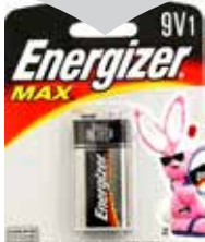
ENERGIZER BATTERY 9V1