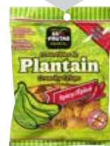
PLANTAIN CHIPY SPICY 85G 50 IN BOX