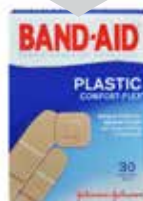
BAND-AID PLASTIC COMFORT- FLEX 30 ASSORTED SIZES