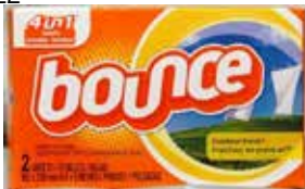
BOUNCE 2 SHEET PACK