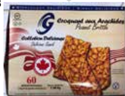
PEANUT BRITTLE 60 PCS