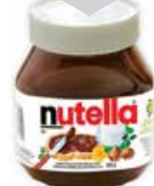
NUTELLA 725 GM