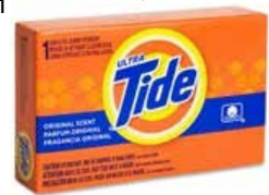
TIDE POWDER LAUNDRY DETERGENT 2 OZ.