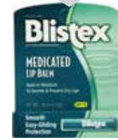
BLISTEX LIP BALM REGULAR 4.25g X 144