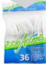
TABLE ACCENTS - PLASTIC ASSORTED CUTLERY WHITE 36PK