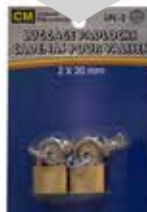
LUGGAGE PADLOCKS 2 X 20 MM LPL-2 BNB