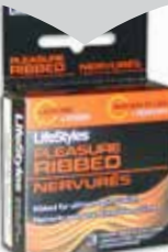
LIFESTYLE CONDOM 3S PLEASURE RIBBED