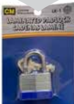
LAMINATED PADLOCK LK-1