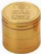
TOBACCO METAL GRINDER 3 PARTS 42MM