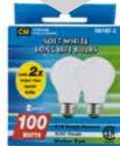
LIGHT BULB 24X2 PACK 100 WATT