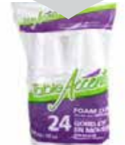
TABLE ACCENTS - FOAM CUPS 295 ML (10 OZ) - 24PK