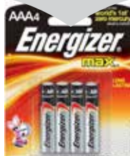
ENERGIZER BATTERY AAA4