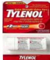
TYLENOL TUBE EXTRA ST 10PK 1-DOZ-DISPLAY