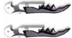
CORKSCREW BEER CAN OPENER