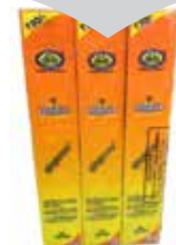
CYCLE PURE AGARBATHIES 12 IN PACK

PRICES SUBJECT TO CHANGE WITHOUT NOTICE APPLICABLE TAXES APPLY P.35