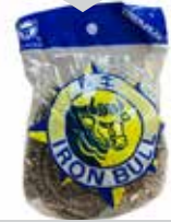
STEEL WOOL SCRUBER SINGLE PACK