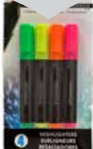
HIGHLIGHTERS - 4 PACK