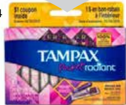
TAMPAX POCKET 3 PACK