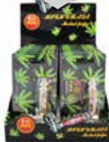
NOVELTY PIPE WITH LID 12pc Display (WITHOUT LEAF)