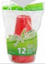
TABLE ACCENTS - PLASTIC BEER CUPS 16 OZ RED - 12PK