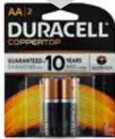
DURACELL BATTERY AA2 (COPPERTOP)