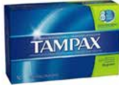
TAMPAX TAMPON SUPER UNSCENTED