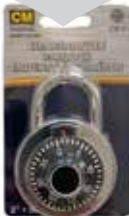
COMBINATION PADLOCK CP-1