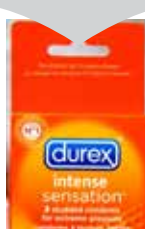
DUREX CONDOMS INTENSE SENSATION 3pk