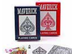
MAVERICK PLAYING CARDS PLASTIC 12 PK

PRICES SUBJECT TO CHANGE WITHOUT NOTICE APPLICABLE TAXES APPLY P.36