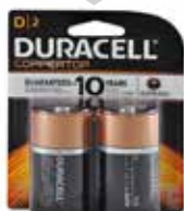
DURACELL BATTERY D2 (COPPERTOP)