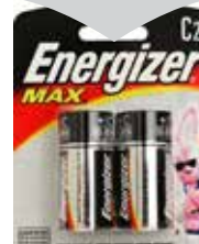
ENERGIZER BATTERY C2

PRICES SUBJECT TO CHANGE WITHOUT NOTICE APPLICABLE TAXES APPLY P.6