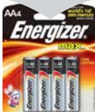
ENERGIZER BATTERY AA4